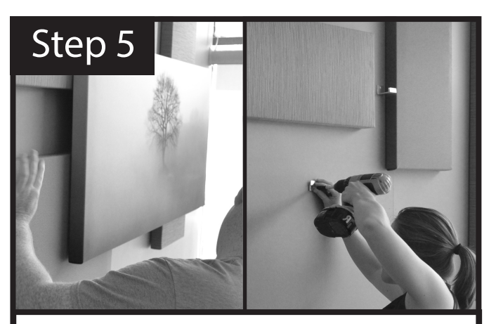
You may have to remove your center panel to install Z-Clips for your additional panels that lie behind the center panel.

Place the top offset mounts for your center panel according to measurements from step 1.