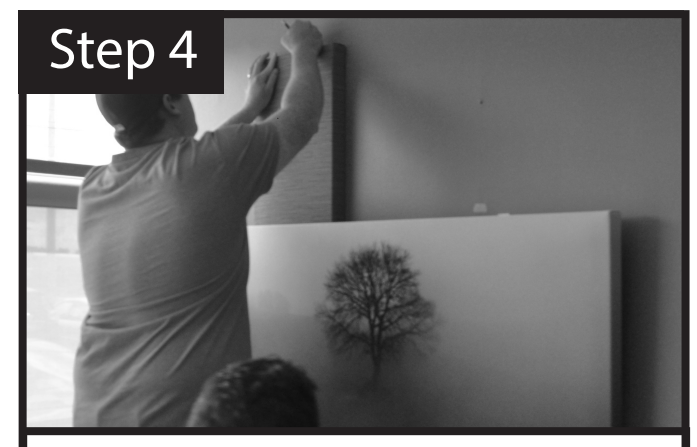
After Installing the center panel, start placing your additional panels around it and marking the Z-Clip placements.

Measure installation wall to find appropriate placement for center panel based off of overall size of arrangement from step 1.